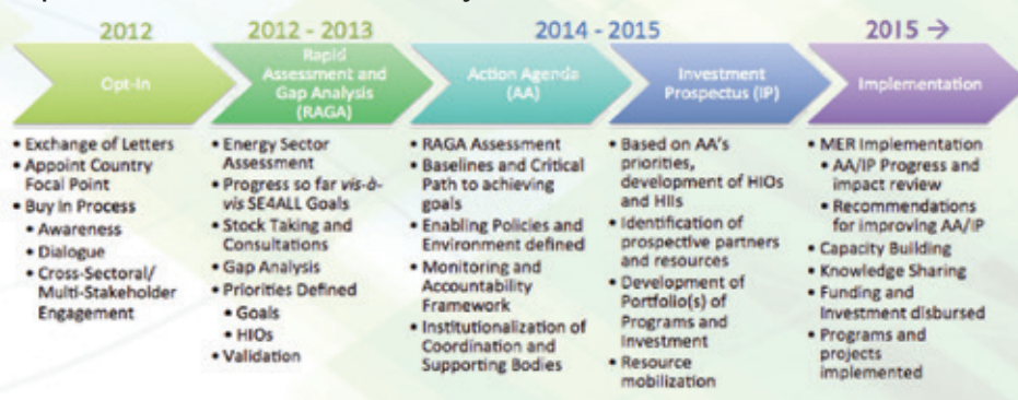
Figure 1: Proposed Actions and Timelines for Kenya 18

The Country Focal Point for SE4All initiated the development of the Action Agenda and Investment Prospectus (AA/IP) in 2014. These developments have been in line with the SE4All process, also reflected in the following diagram.